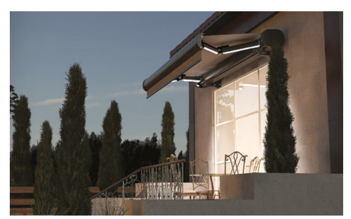
Orion Plus Luxe