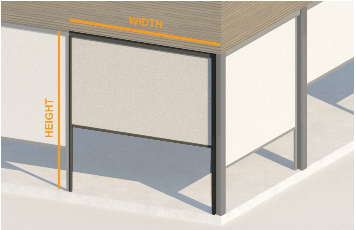
This image is a representation of a product called Motorised Blind (Sun Store - Horizontal)