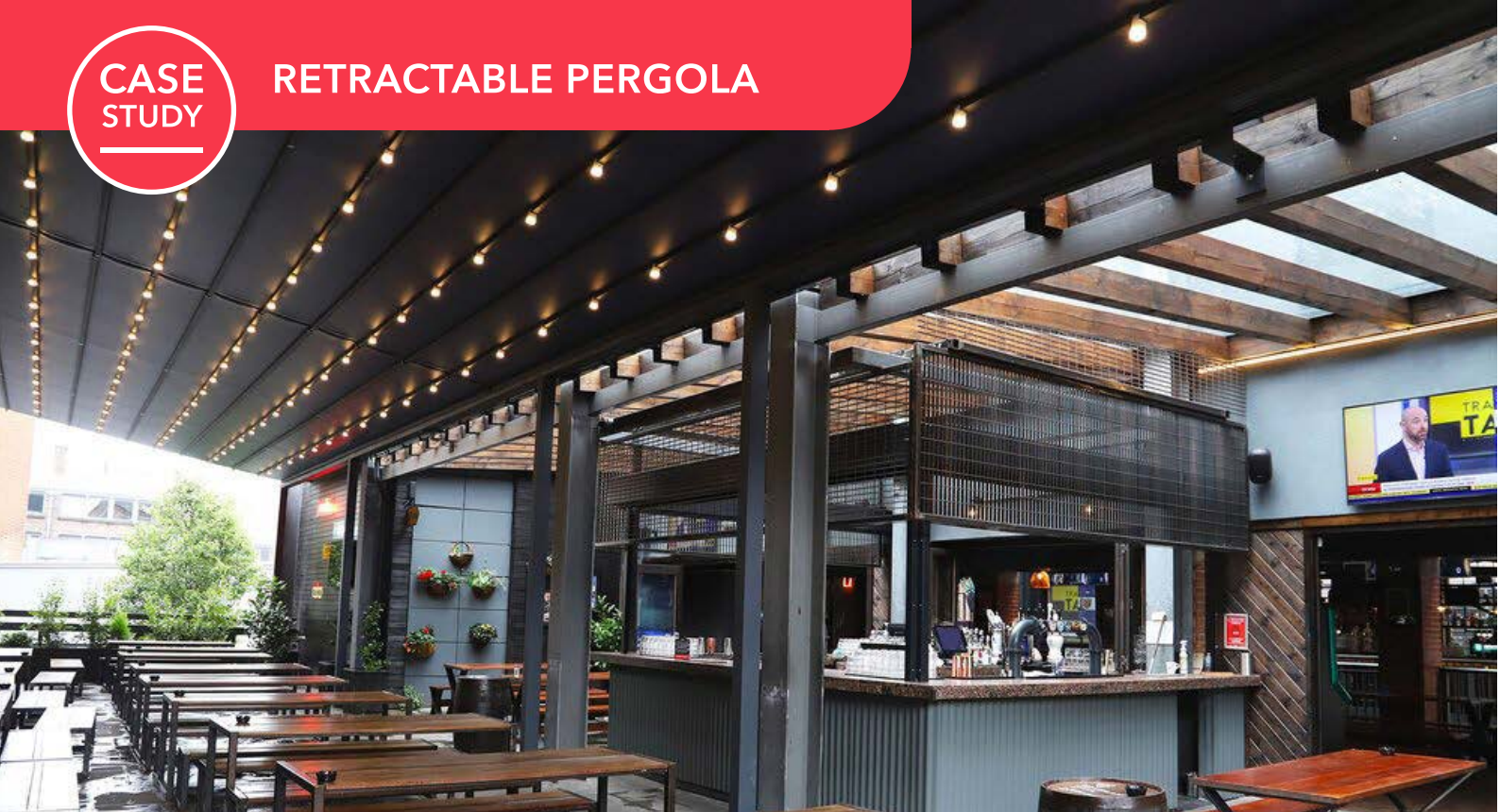
SUTTON COLDFIELD PROJECT BIRMINGHAM | SUBULATE QUERCUS MINIMA | Retractable Pergola